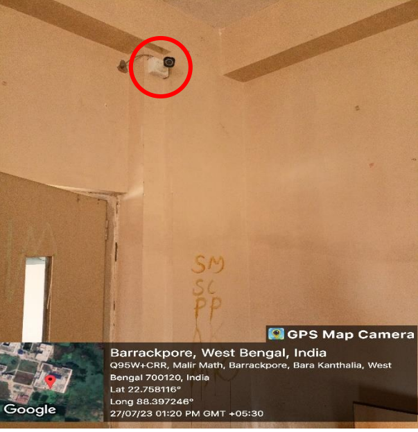
CCTV in Class Rooms CCTV in La sociatories

Barrackpore, West Bengal, India Q95W+CRR, Malir Math, Barrackpore, Bara Kanthalia, West Bengal 700120, India Lat 22.758012° Long 88.397148° 27/07/23 01:20 PM GMT +05:30